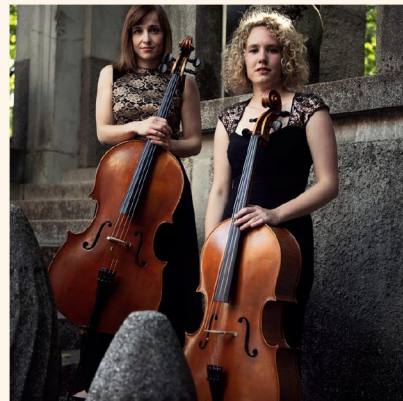
Saturday 17 February Hempstead Library Duo Furioso