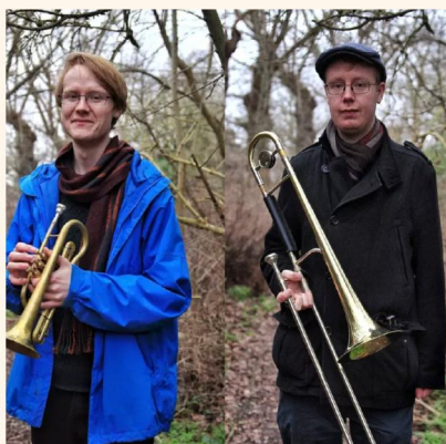
Saturday 3 February Chatham Community Hub The Windy City Weatherbirds