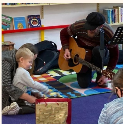
Saturday 16 March Lordswood Library TBC