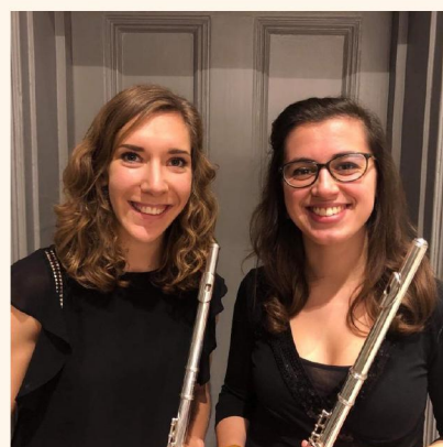
Saturday 23 March Lordswood Library Fluteshake